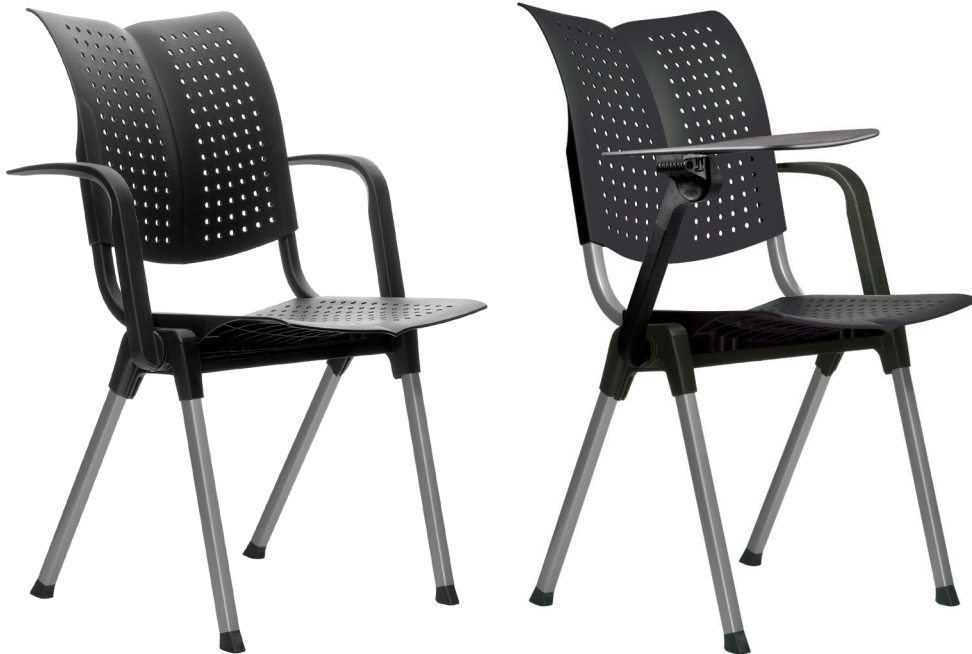
Design: Peter Opsvik. Patent and design protected.

Constructed from lightweight materials, recycled automobile bumpers and plastic household waste bottles, the wing shape back gives the chair a fresh shape that can withstand heavy use. The HÅG Conventio Wing is self-stabilizing on uneven ground and is never unstable when sitting. Simple maintenance makes the chair well suited as a general purpose chair for conferences, schools, universities, libraries, canteens, cafés and hotels.